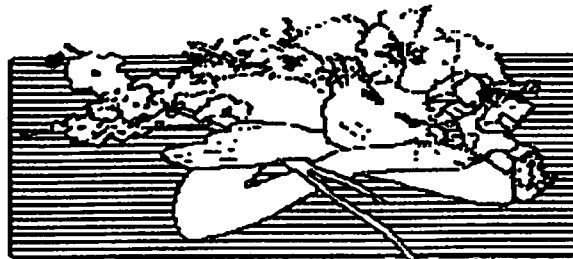
Dreaming of my CoCo4!