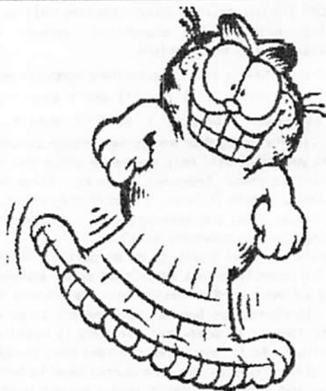
THE CoCo SHUFFLE!

So, as mentioned above, with the magic of the conversion programs I found and time, nothing is out of reach! Clip Art, NO PROBLEM! Saving money, NO PROBLEM! Once again the CoCo earns it's keep. And once again the CoCo shows the PC community that it can keep pace with them without having to spend big PC BUCKS! As CoCo owners, we have a machine we can be proud of. One that allows us to perform complex computer tasks and still be able to buy new shoes for the baby. A machine that can grow with you as your computer needs expand. A machine that has stood the test of time, time and time again. Yes my fellow CoCo friends, we may not have all the software or hardware that the PC enjoys, but what we do have is very good and very affordable (theres that word again)!